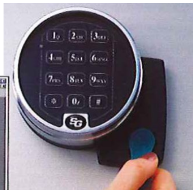
Audit trail coordinates your security

Programmable Time Delay. To further deter robberies, a programmable time delay of up to 99 minutes is available. A time delay override mode is available when authorized personnel require immediate access.